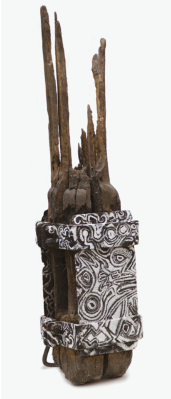
Prise de terre 1997. 120 x 60 x 60 cm. Wood and anti-rust paint on metal. L'élan 2022. 144 x 116 cm. Charcoal on Arches paper.