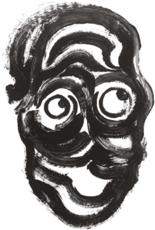
Autonome Masse 6/23 2005. 72 x 52 cm. Lacquer on coated paper. (Private collection)