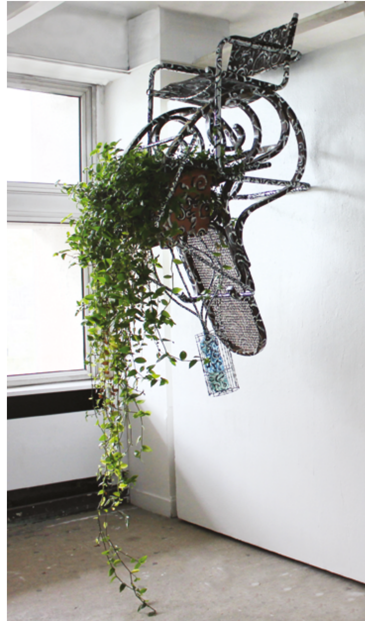
Le chef de la bascule 2021. Assemblage of painted chairs, a bottle of water, earth, and plants.