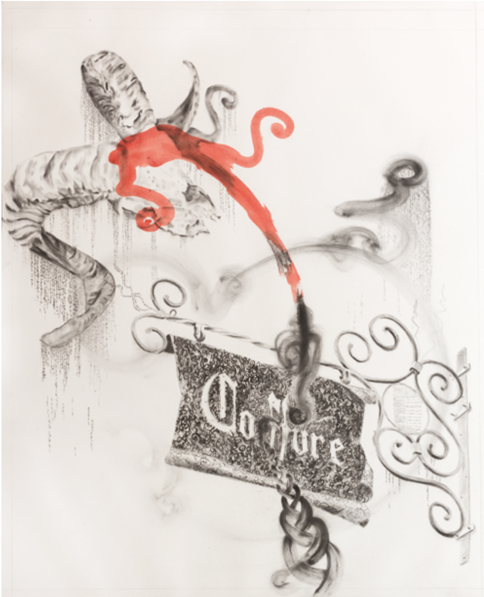
L'enseigne ment 2018. 160 x 130 cm. Charcoal and watercolor on paper. Nappy logue 2015. 30 x 37 x 22 cm. Painted maracas and steel wool.