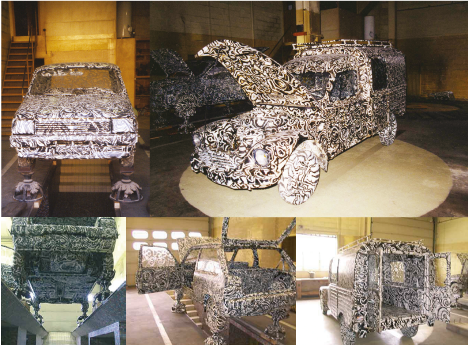
Vis ta mine 1997. Austin Metro entirely covered in anti-rust paint. Acadia Ego 2001. Citroën Acadiane entirely covered in anti-rust paint.