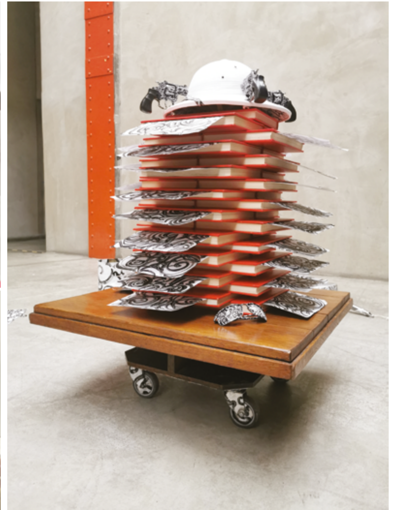
L'énigme du trou blanc 2021. Performance : 30 minutes. Les Nouveaux Collectionneurs, Espace Voltaire, Paris. Installation: colonial helmet, 4 pistols, encyclopaedias, poska drawings on paper, a wooden table on wheels.