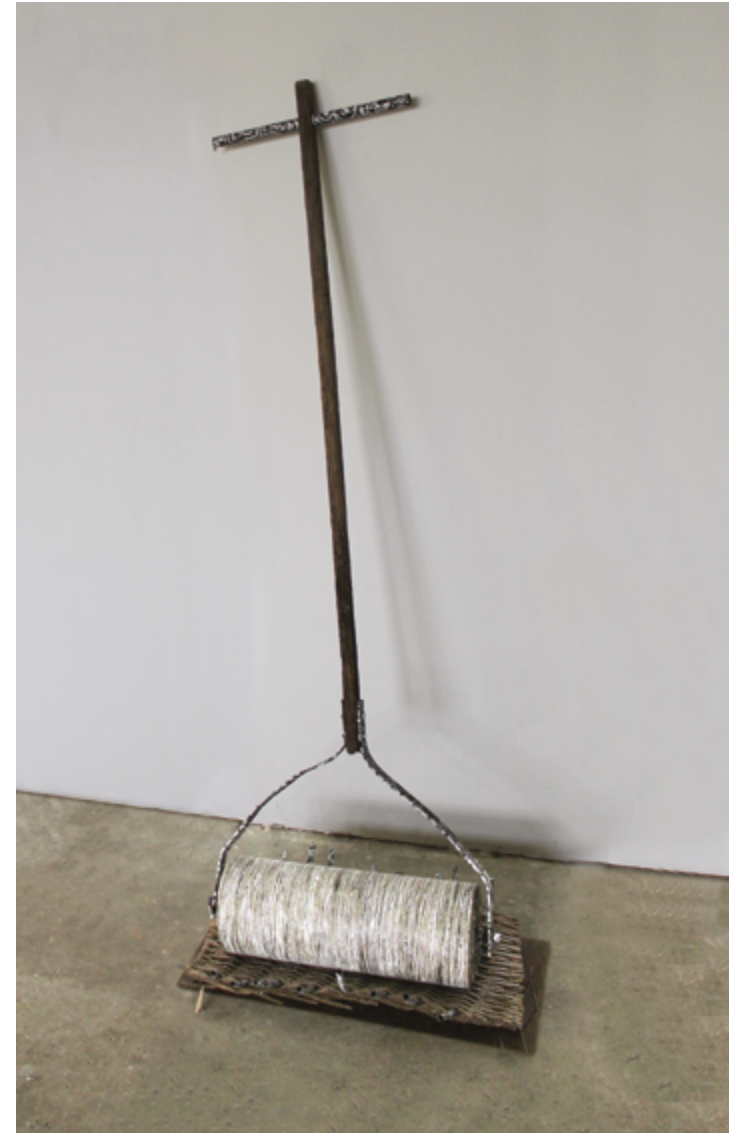
Rouleaux rouleaux 2015. 150 x 120 cm. Charcoal on paper.