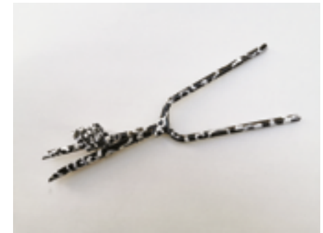
La forge des choses 2018. 73 x 92 cm. Oil on canvas mounted on a wooden frame. La pince à boucler 2020. 3 x 26,5 x 6 cm. Painted metal pliers.