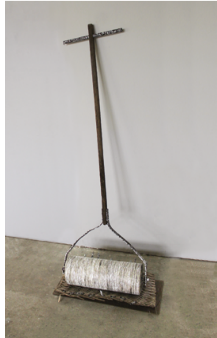
Rouleaux rouleaux 2015. 150 x 120 cm. Charcoal on paper.