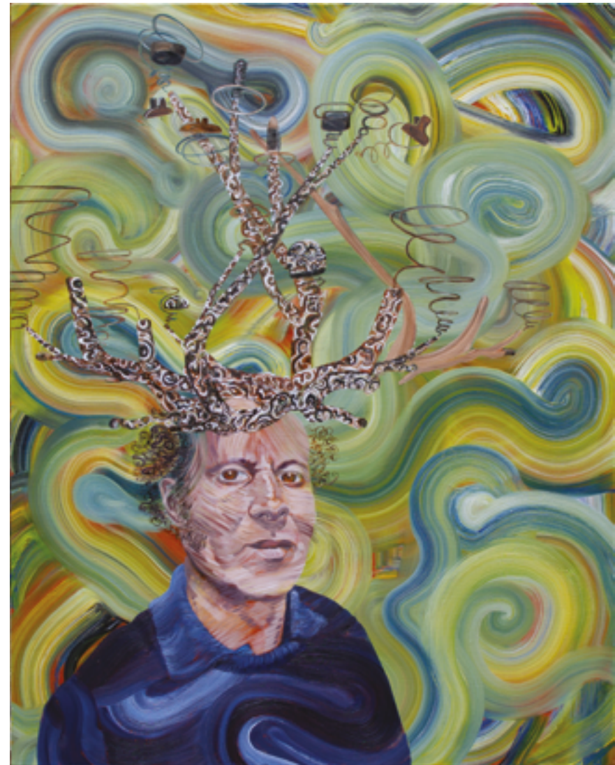
Sera ci 2020. 69,5 x 63 x 28 cm. Painted prunus branch, springs and balls, on charcoal. Le Myrobolan 2021. 95 x 73 cm. Oil on canvas mounted on a wooden frame.