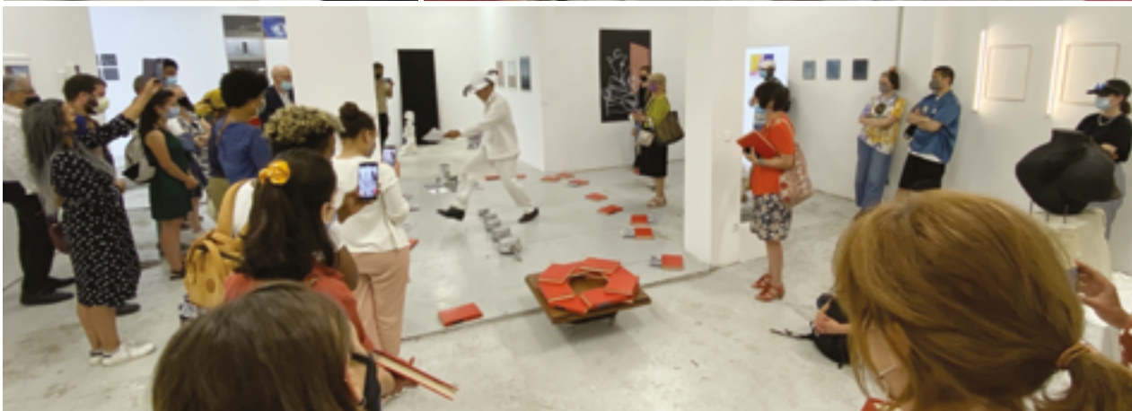
L'énigme du trou blanc 2021. Performance : 30 minutes. Les Nouveaux Collectionneurs, Espace Voltaire, Paris. Installation: colonial helmet, 4 pistols, encyclopaedias, poska drawings on paper, a wooden table on wheels.