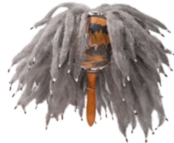
L'enseigne ment 2018. 160 x 130 cm. Charcoal and watercolor on paper. Nappy logue 2015. 30 x 37 x 22 cm. Painted maracas and steel wool.