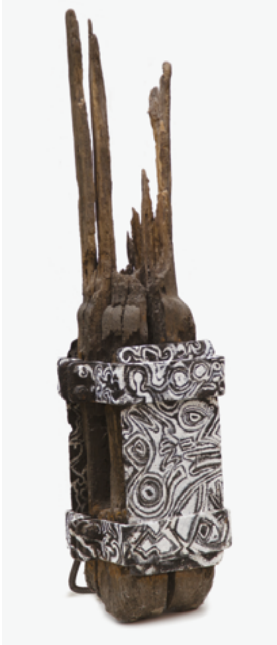
Prise de terre 1997. 120 x 60 x 60 cm. Wood and anti-rust paint on metal. L'élan 2022. 144 x 116 cm. Charcoal on Arches paper.