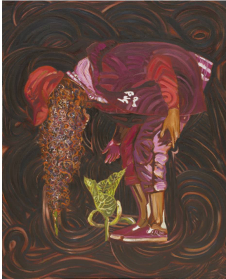
Dans les choux 2018. 92 x 75 cm. Oil on canvas mounted on a wooden frame.