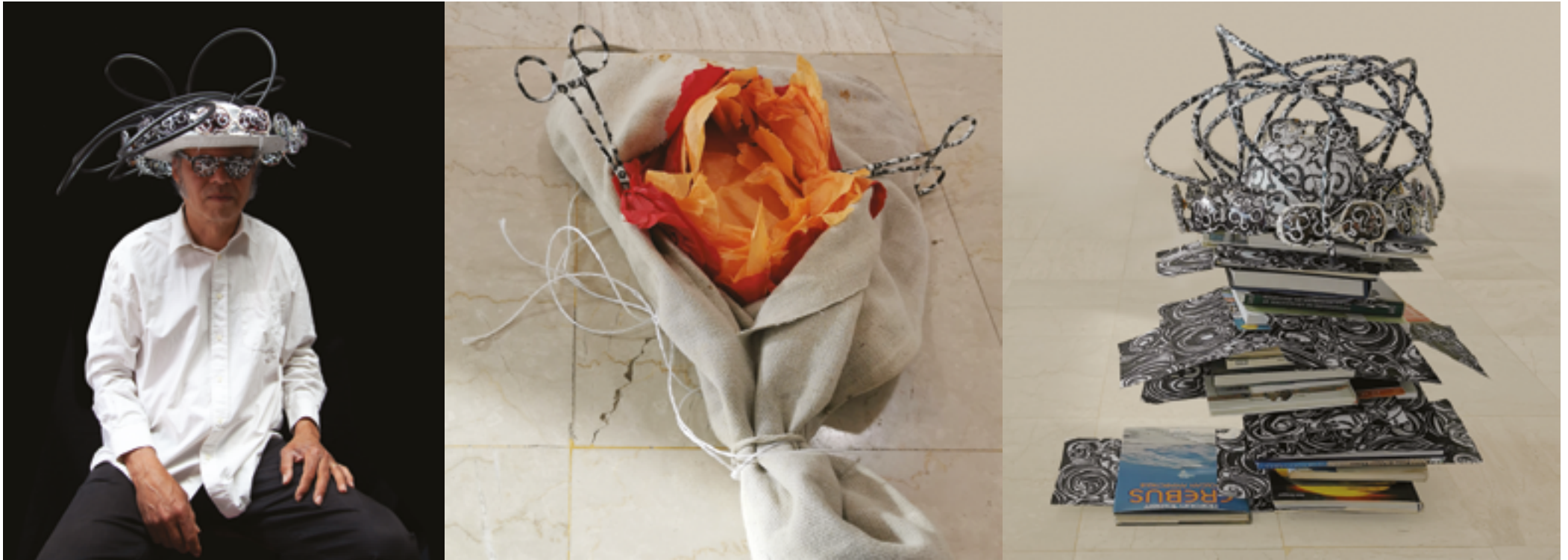
Mur mûr capillaire 2022. Performance : 30 minutes. African Art Book Fair (AABF), Dakar (Senegal). Installations: cloth, paper, string, surgical scissors, painted hat, books, and poska drawings on paper.