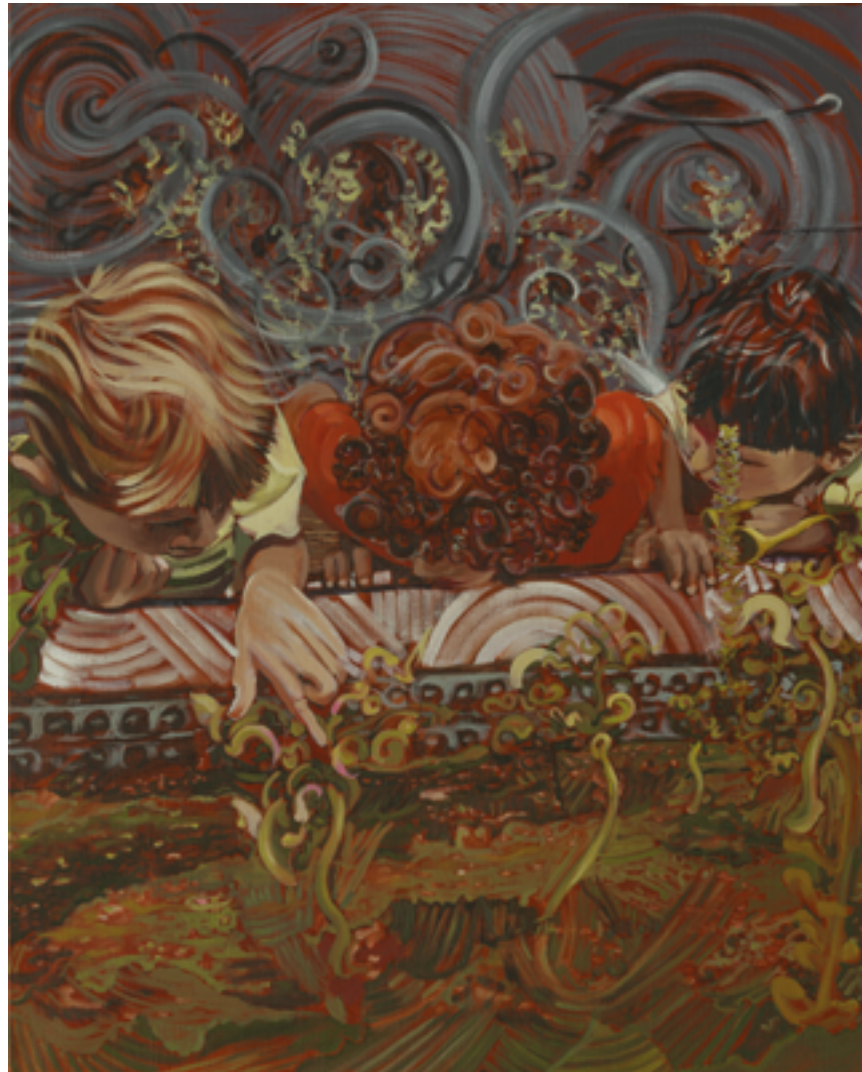
Des coupes vertes 2018. 81 x 65 cm. Oil on canvas mounted on a wooden frame. (Private collection)